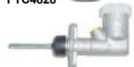
550732G or 550732P