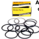
AEU1547 seal kit: does one front caliper, both rear.