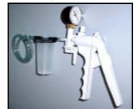
Mityvac Pump pulls fluid through or empties reservoirs 386-215