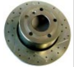
Heavy duty service slotted & drilled rotors