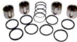
STC1278 Pistons and seals, does one caliper