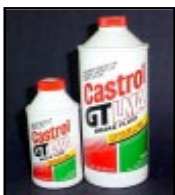
Genuine Castrol DOT 4 brake fluid: 12 oz. GTLMA 32 oz. GTLMA/L