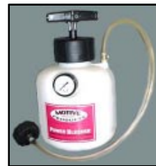
Euro Power Bleeder pushes fluid through the system: 0100

Calipers require periodic maintenance for best brake operation. Replacing the brake fluid is an LR specified maintenance procedure, to be done roughly every 48,000 miles: this removes water and contaminates, preserving the seals and the piston surface. Should a piston begin to leak or stick, usually a new piston and seal kit will put it right: no need for a whole caliper assembly. Any major brand of DOT 4 fluid will work fine. Our Mityvac or our Power Bleeder are good tools for one person alone to do the job with.