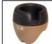
Disco jumbo cupholders

Front right MXC7182PUB Front left MXC7183PUB Rear right MXC6730PUB Rear left MXC6731PUB Individual flaps