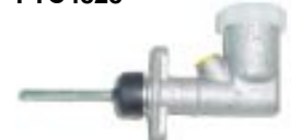
550732G or 550732P