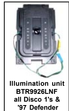
Illumination unit BTR9926LNF all Disco 1's & '97 Defender