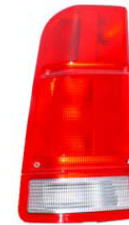
Tail Light LH XFB000170 '99-'02