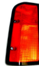
Tail Light LH XFB000451 '03-'04