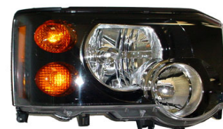
'03-'04 Headlight Assembly RH XBC501460

'99-'02, with bulbs & holders '99-'02, with bulbs & holders '03-'04, with bulbs & holders '03-'04, with bulbs & holders