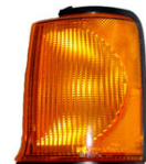
Turn Signal LH XBD100880 '99-'02