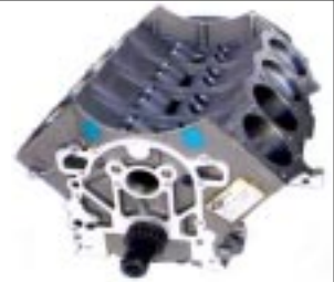
Front cover with oil pump