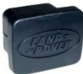
Trailer receiver plug, 2" ANR3196 Plastic, press fit