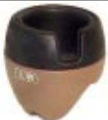
Tan STC53156SUC Grey STC53156LPW