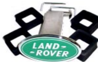
Deluxe 2" receiver plug Chrome, lockable LRK91690