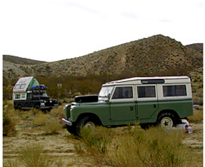
1965 Land Rover 109 Station Wagon and 1960 Land Rover Dormobile camped in Jaw Bone recreational area, California

HELP LINE: 661-257-8634 24 HOUR FAX: 661-257-9765